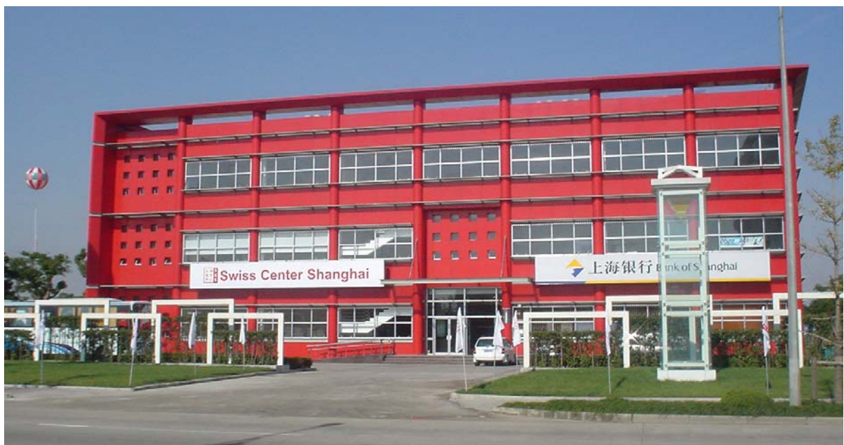
SCS Instant Desk Space in Shanghai Xinzhuang Industry Park