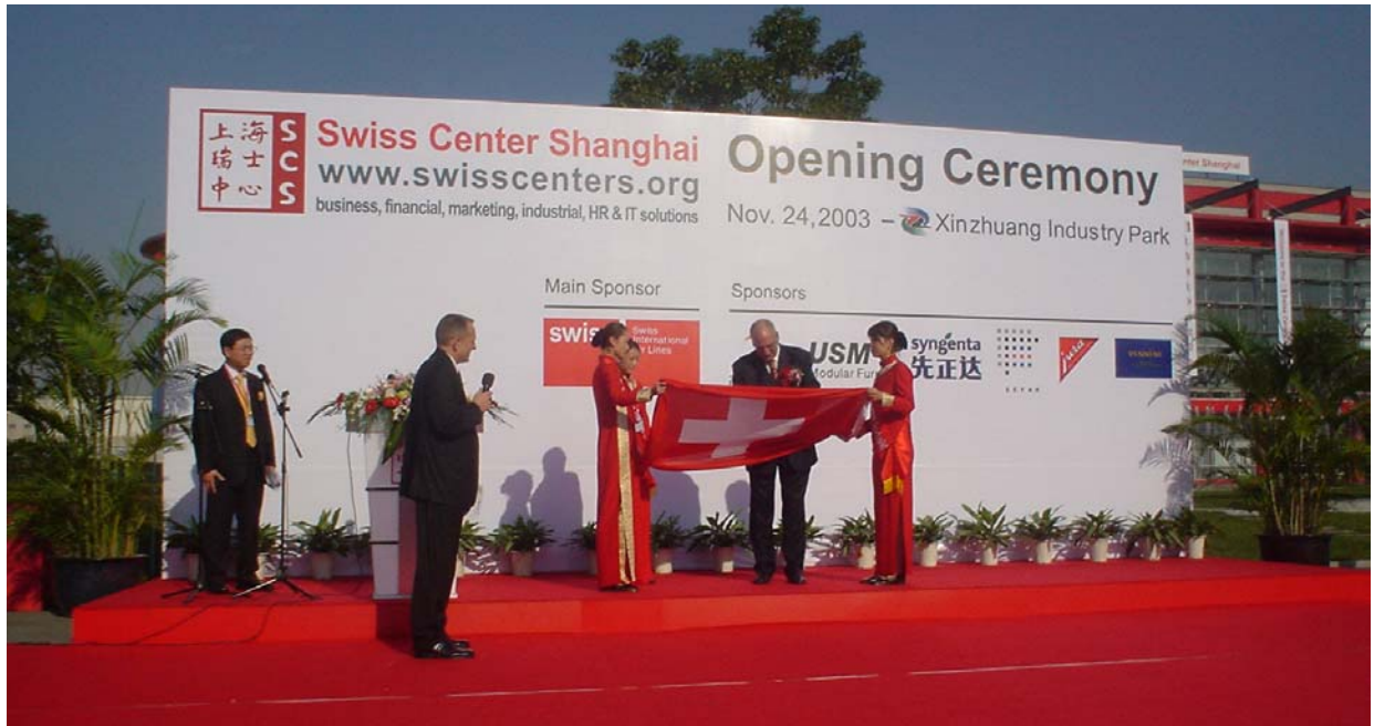
The Swiss President is signing a Swiss flag – his present for the Swiss Center Shanghai

Swiss Center Shanghai www.swisscenters.org business, financial, marketing, industrial, HR & IT solutions