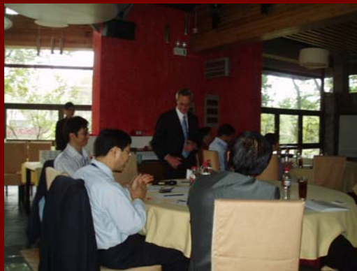
Participants introduce themselves to each other